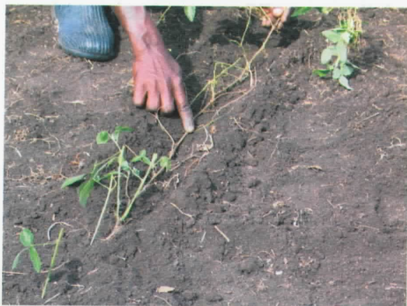
Fig. 3. Planting Vines