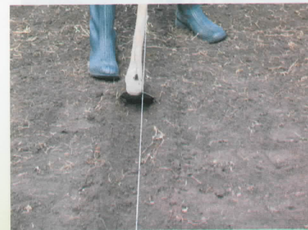
Fig. 2. Making Furrow for Planting Vines

Mark the rows, 75cm apart using strings. Using a hoe, make a furrow 2 cm deep along the strings (FIG. 2).