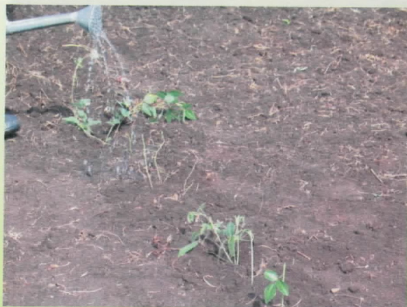
Fig. 4. Watering Planted Vines